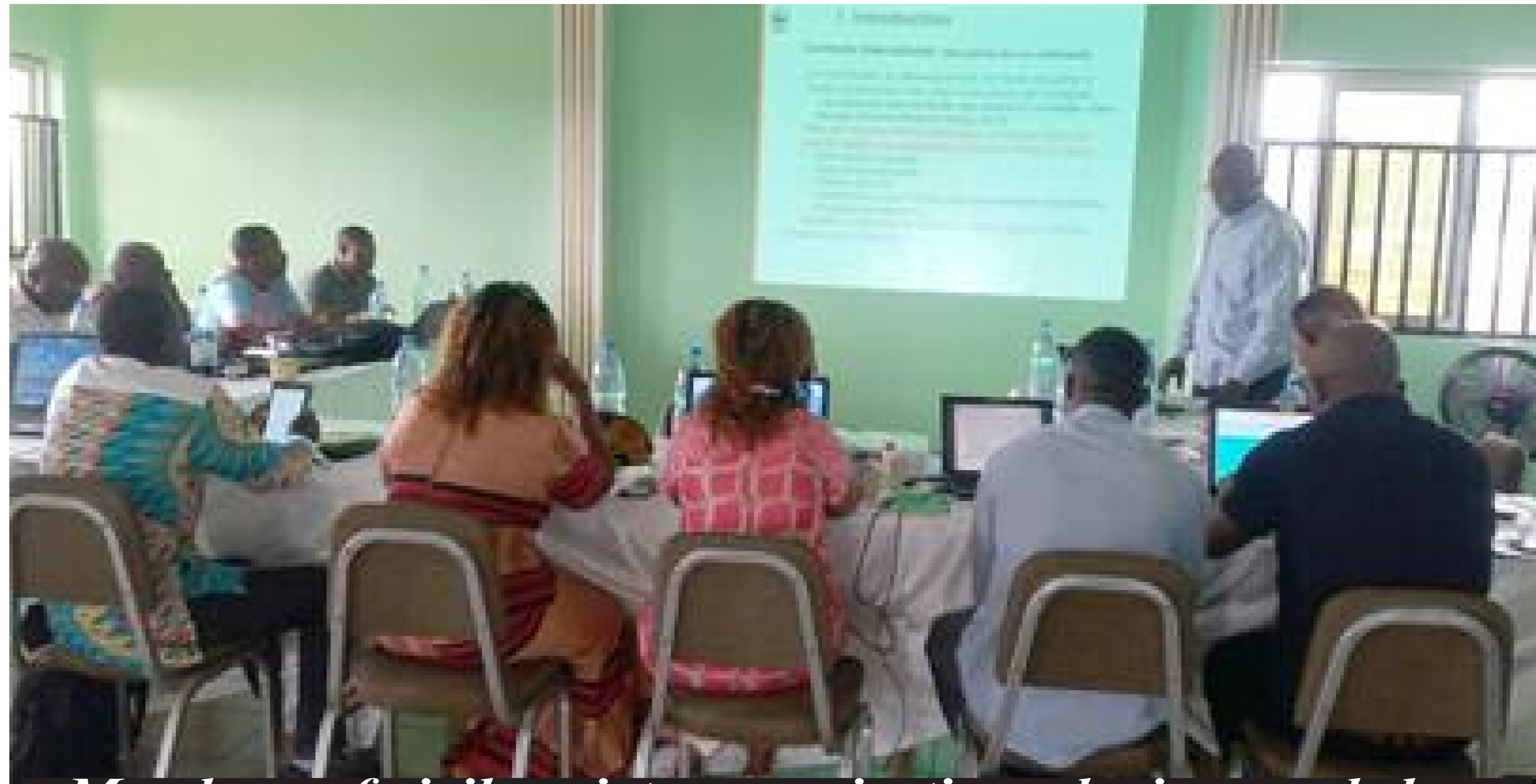
Members of civil society organisations during workshop

They also advised government to ensure that such a strategy is lodged