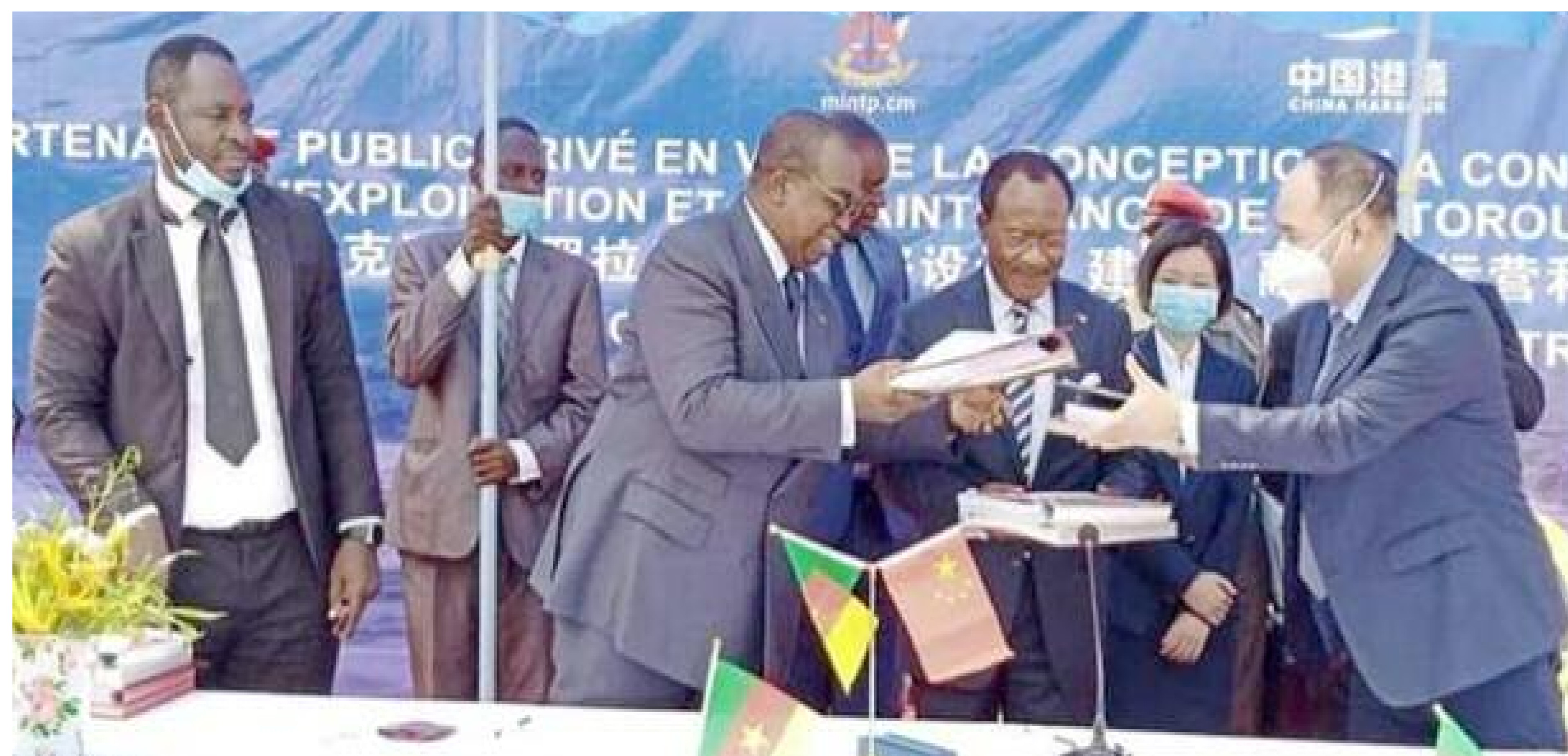
Ministers Motaze, Nganou Djoumessi and CHEC GM exchanging signed documents

Minister Nganou Djoumessi said the delay in formalization of the partnership as well as the completion of the project is mainly due to treasury tensions and the current health crisis due to the novel