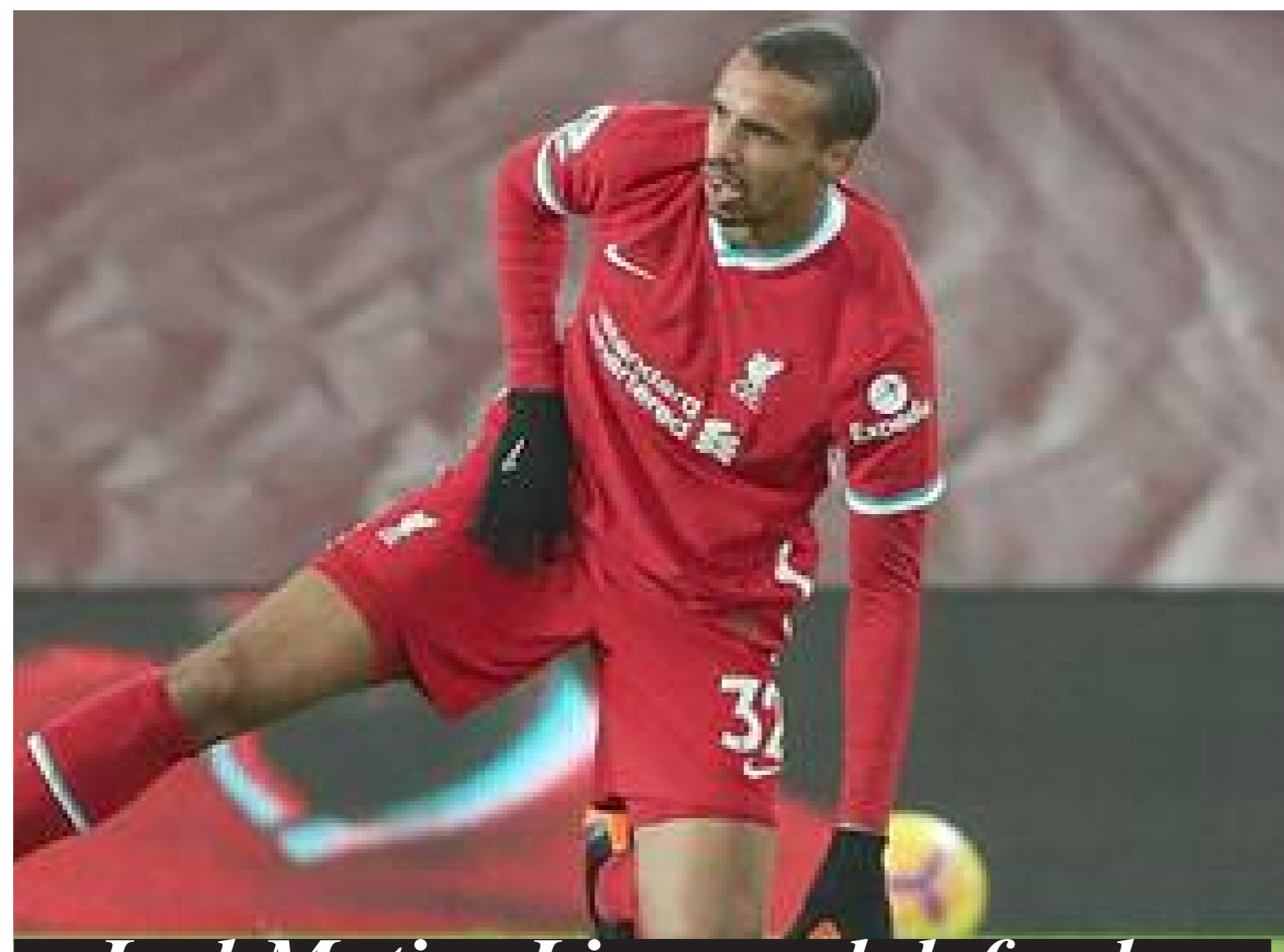
Joel Matip: Liverpool defender

"The normal situation for this kind of injury is around 3 weeks. Joel told me he felt