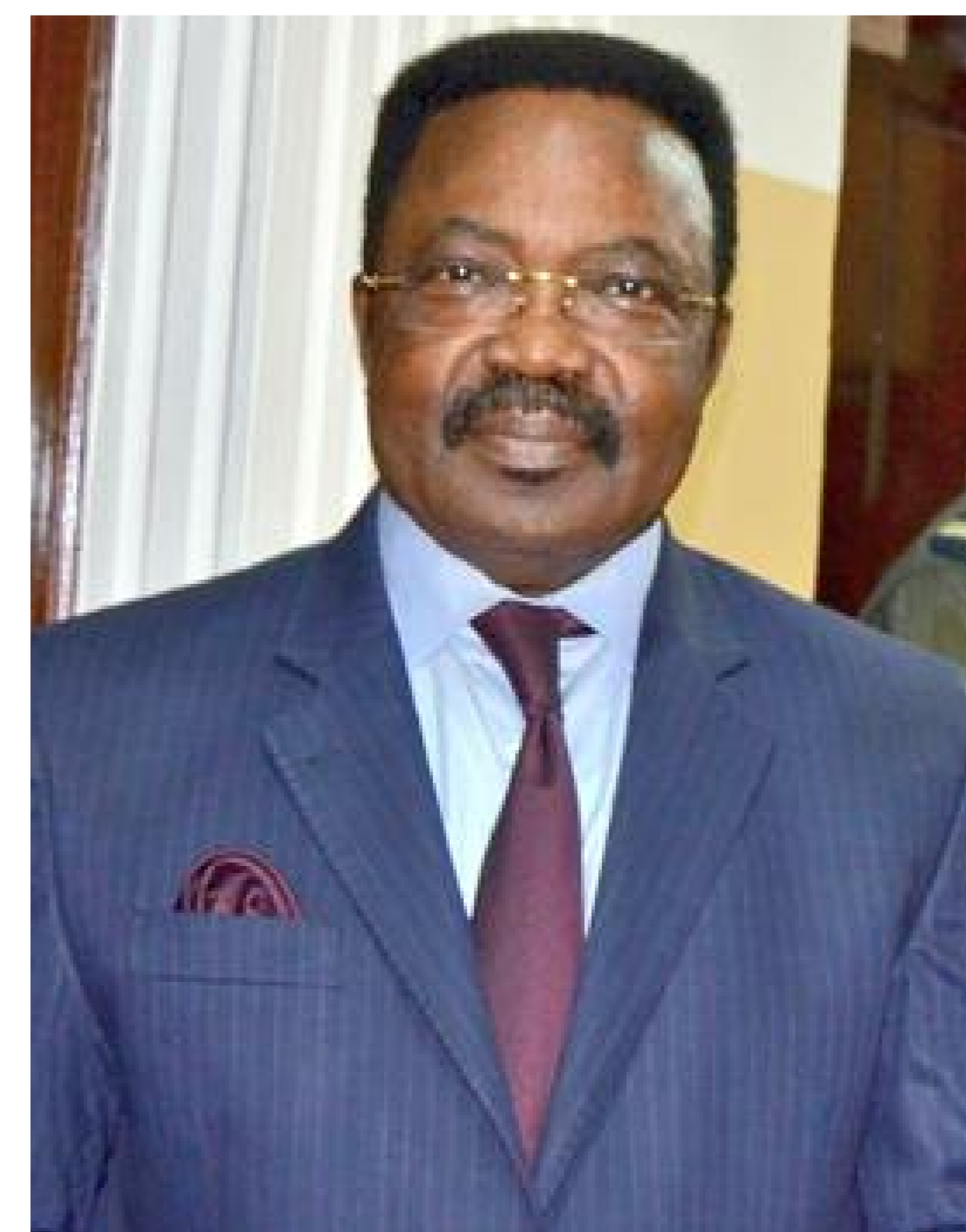
Minister Felix Mbayu: Hailed for indiscriminate generosity